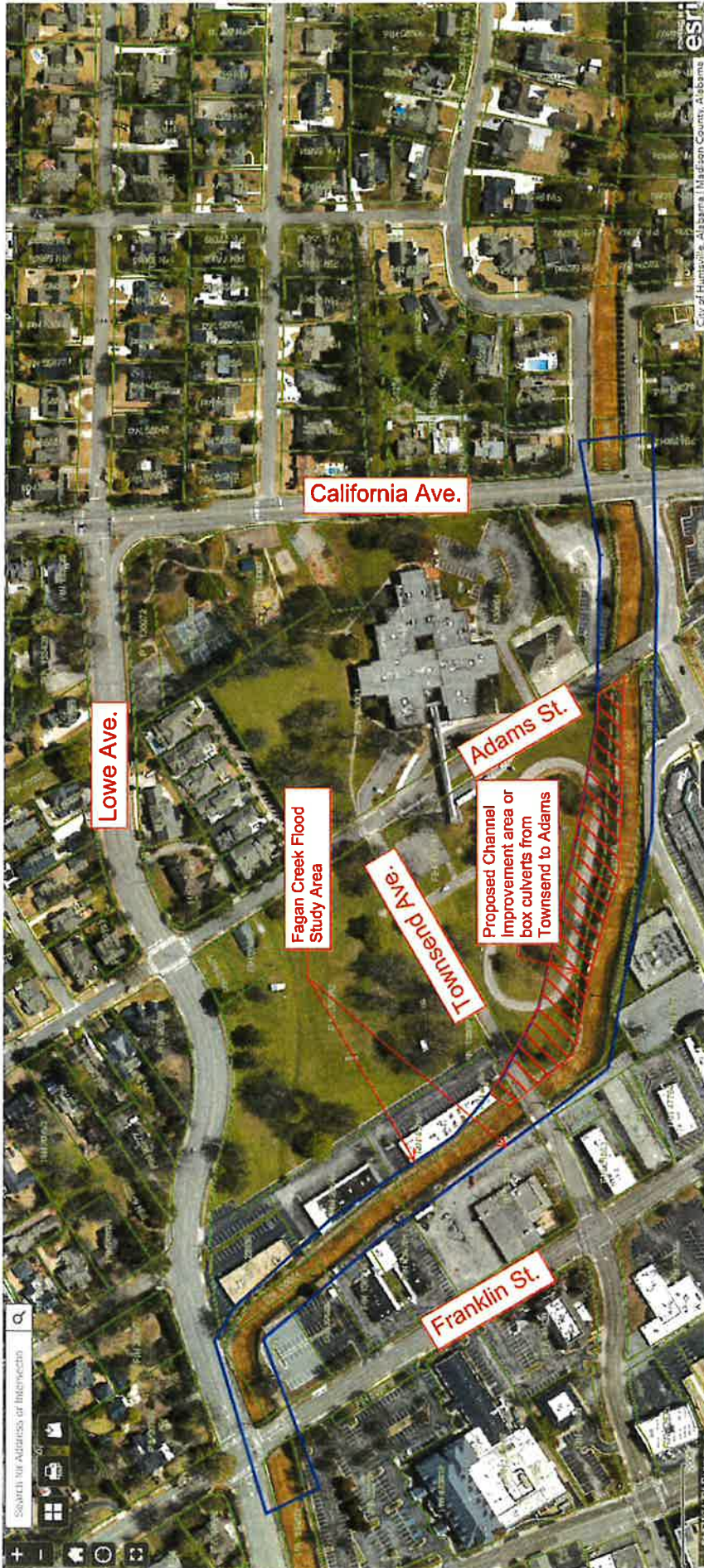
AERIAL PHOTOGRAPHY (2024)